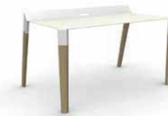
desk 100cm x 60cm / 140cm x 70cm / 180cm x 70cm (all 75cm high)