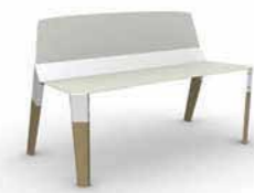
bench 120cm/160cm (length)