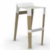
low back bar stool 80cm (seat height)