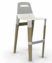
highback bar stool 80cm (seat height)