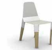
chair 45cm (seat height)