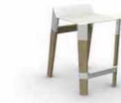
lowback bar stool 60cm (seat height)