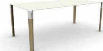
table 160cm x 90cm / 180cm x 90cm / 200cm x 100cm / 250cm x 100cm (all 75cm high)