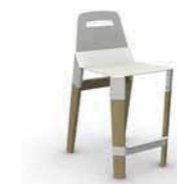
highback bar stool 60cm (seat height)