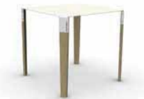
table 80cm x 80cm (75cm high)